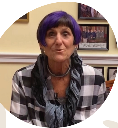
Rep. DeLauro speaking at the opening plenary of the 2021 Good Food Conference

In the United States, GFI's advocacy efforts helped establish U.S. Representative and House Appropriations Chair Rosa DeLauro as the leading alternative protein champion in Congress. In 2021 Chair DeLauro called on the Biden administration to increase funding for alternative protein research, and she has repeatedly conveyed her support for GFI's mission.