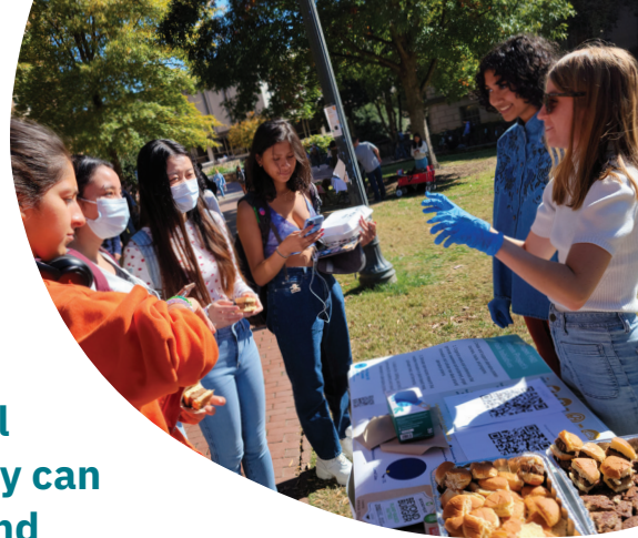
Students from UNC Chapel Hill's Alt Protein Project hosting a campus taste test of plant-based meat