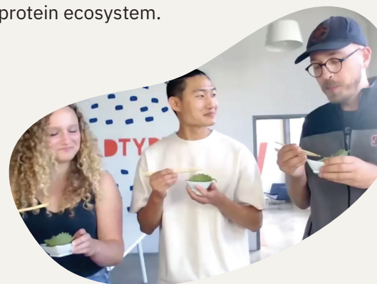
Stanford Alt Protein Project students taste Wildtype cultivated salmon

Student and academic leaders worldwide helped launch nine new alt protein courses, hosted 70+ events, and motivated faculty researchers to apply for (and successfully secure!) grants that they likely would not have otherwise.