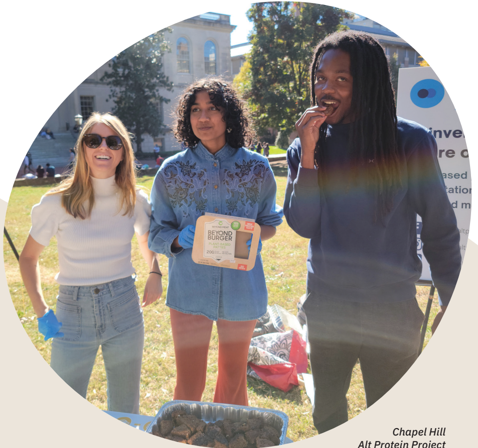
Chapel Hill Alt Protein Project

In 2021, GFI teams prioritized investing in both science and students, knowing the transformative power of each to nourish a growing alternative protein ecosystem. This past year alone, GFI awarded $5.7 million to 54 open-access research projects across 10 countries on four continents. At 16 of the world's top universities, GFI engaged and supported students and faculty to create new alt protein courses, pursue critically needed research, and share their work with the world. In just the past year, GFI grantees and staff scientists published 15 peer-reviewed articles based on GFI-funded research.