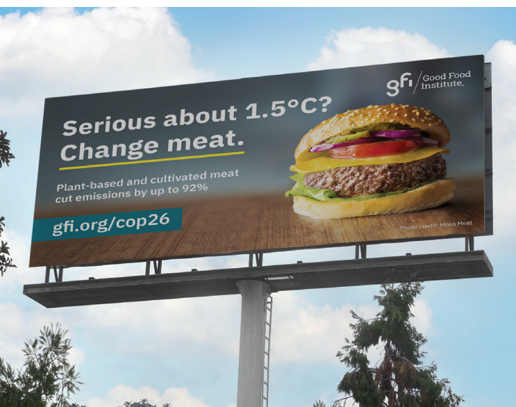
Billboard for COP26, Glasgow

This brighter future relies on the world to radically rethink its relationship with food, land, and animals. As we move closer to 2030, the year by which global emissions must be halved in order to stand a chance of limiting warming to 1.5°C, the choices we make increase in importance and urgency. In 2021, GFI's work with the climate community and global leaders nourished the soil of the alt protein ecosystem, ensuring a better food future can take root and grow. 🌱