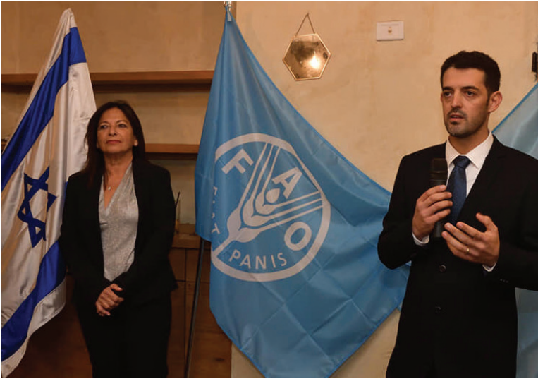
Nir Goldstein and Ambassador Yael Rubinstein

The collaboration between GFI Israel and the Israeli government also inspired Israel's ambassador to the Food and Agriculture Organization of the United Nations (FAO), Yael Rubinstein, to organize an event dedicated to Israeli alternative protein innovation. In this first-of-its-kind gathering, delicious tastings of cultivated meat were prepared by Aleph Farms and served to the 100 guests in attendance, allowing senior leaders from the FAO, the World Food Programme, and the International Fund for Agricultural Development to taste the future of food.