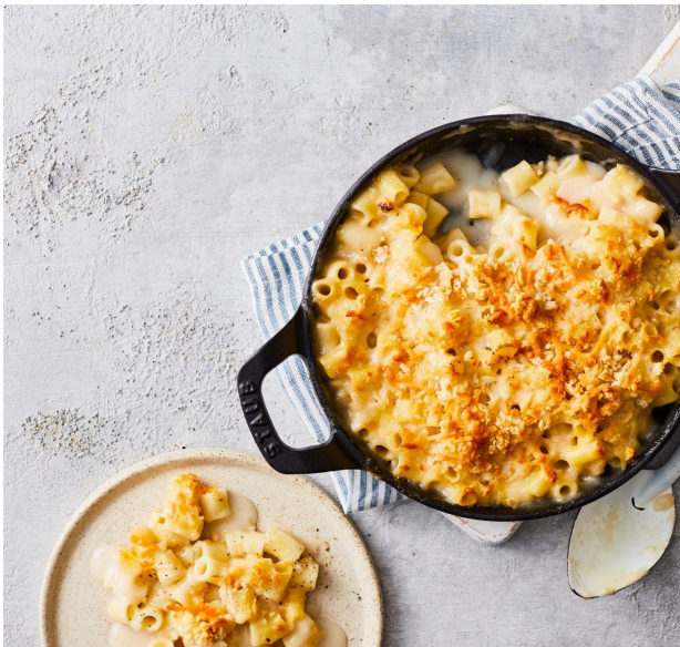
Plant-based meat and dairy alternatives made using Kerry Ingredients. Photos courtesy of Kerry.

Regional trends, resource profiles, and cultural perceptions continued to drive divergence in regional approaches to developing new food production systems, though some global trends emerged. While governments across the world were most likely to invest in biomass and precision fermentation, governments in the Asia Pacific region invested more heavily in cultivated meat, while those in Europe and the Americas invested more in plant-based proteins. Research grants were common across borders—sometimes literally, with several bilateral research grants announced in 2025—but Europe and the Americas tended to prefer business grants and loans to support commercial enterprise, while the Asia Pacific region typically funded new facilities directly, either as publicly operated organizations or through public and private investments. And though governments invested in new ways to produce all kinds of foods, Europe led the world by far in developing and producing plant-based and fermentation-enabled cheese.