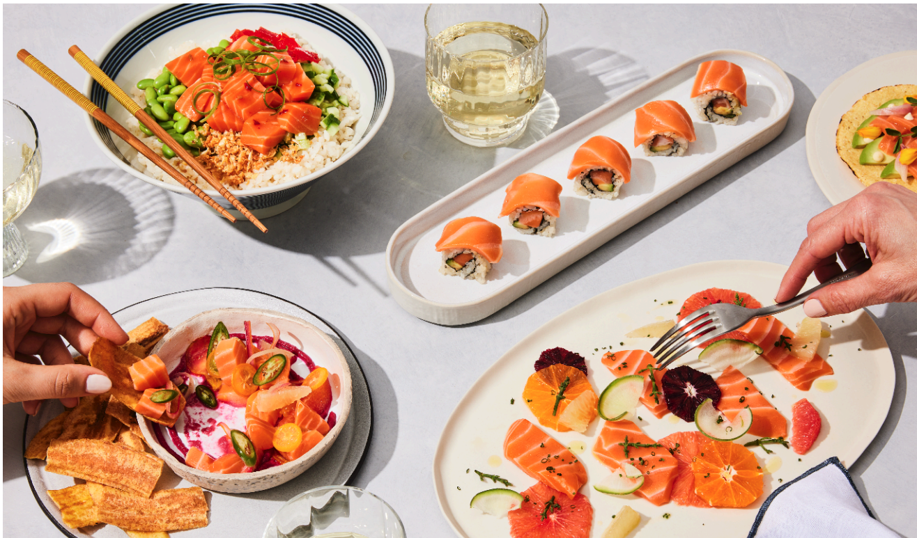
Wildtype cultivated seafood.

In May 2024, the Thai Food and Drug Administration published a draft “Proposal for Developing Regulations and Regulatory Measures Governing the Supervision of Alternative Protein Products” for public comment. The proposal would set technical and labeling requirements for plant-based food, including categorizations of plant-based proteins and specific label text, and restrict the use of certain terms, including “meat.” The draft proposal remained pending throughout 2025. If finalized without safeguards, the restrictions could raise compliance costs and create marketing barriers for plant-based meat and dairy companies, and may set a precedent for cultivated and fermented proteins.