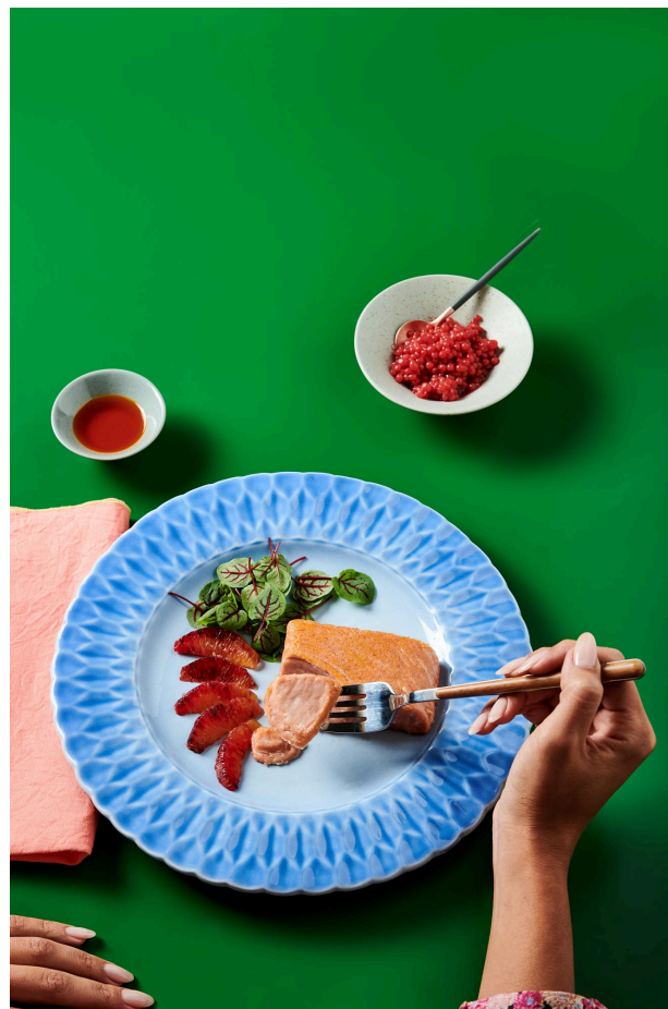
Oshi's salmon filet.

While the full scope of China's investment in alternative protein research and commercialization is not consistently made public, the announced efforts in 2025 point to a robust, economy-wide effort to provide the industry with the capital and policy support needed to overcome technological hurdles, achieve scale, and gain market share.